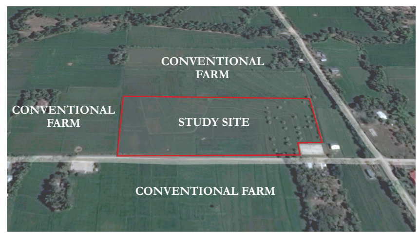
Figure 1. Google Earth view of Manang Fe's organic rice field at Langkong, M'lang Cotabato (red box).

depending on the size of the paddy, at a depth of 0-15cm with the use of a bucket auger. Collected representative soil samples per paddy were pooled to obtain composite samples.